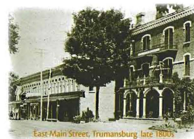
East Main Street, Trumansburg late 1800s